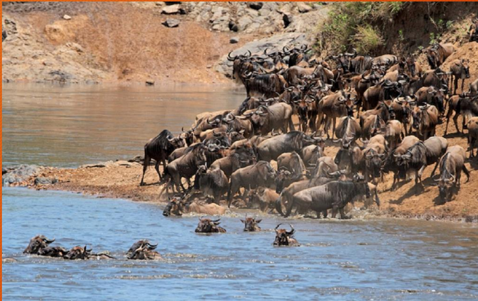
Masai Mara National Reserve