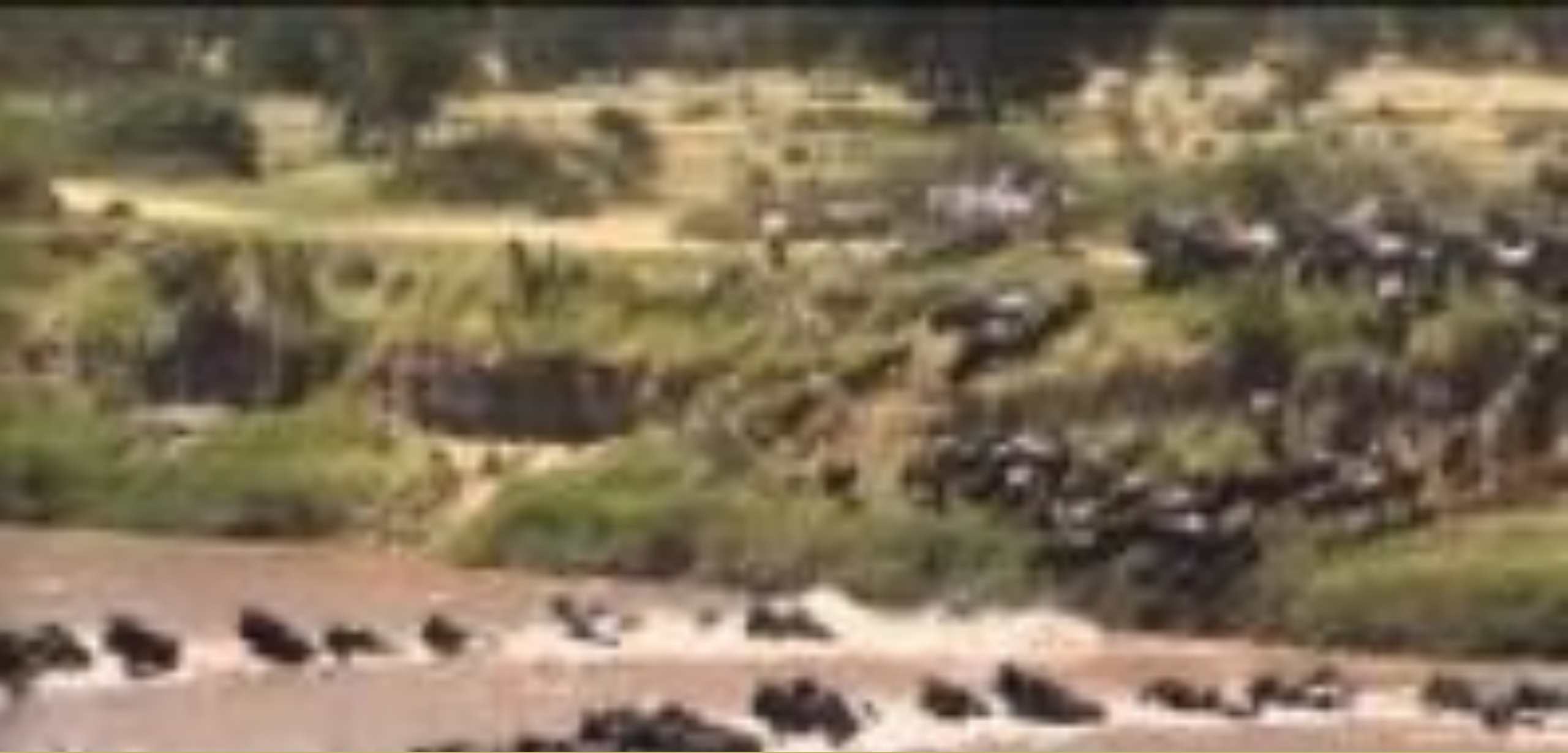
Safari: Kenya and Tanzania Great Wildebeest Migration