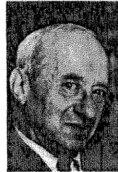
Alfred Tarski 1902 -